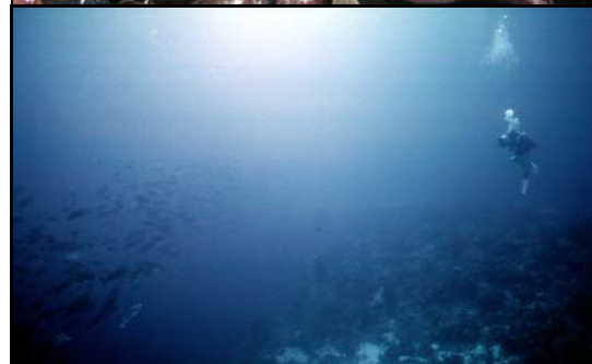
1st image: solitary Nassau grouper on the reef in its normal (non-breeding) colour-phase. 2nd: Nassau grouper on the Little Cayman SPAG (in spawning colouration). 3rd: Nassau grouper caught during spawning in 2002. 4th: DoE diver videoing the SPAG.