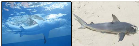
Left: hooked reef shark (tagged and released during our research). Right: Cayman reef shark with chop wounds to the head and stomach, suggesting that it was accidentally hooked but killed rather than released.

Worldwide, about 5 deaths are caused by sharks each year—many of these cases of mistaken identity in areas where underwater visibility is poor. Though often feared and misunderstood, Caribbean sharks are shy and graceful fish-eaters which are far less dangerous to humans than bees (which cause about 100 deaths annually), falling coconuts (150 deaths), and toasters (800 deaths).