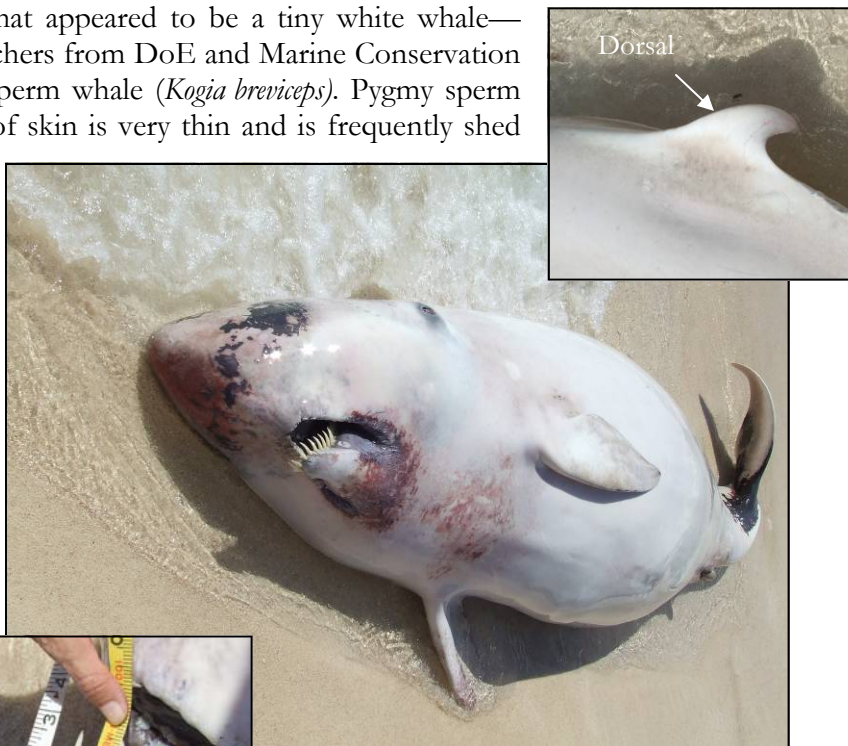
Center: Pygmy sperm whale on the beach in Grand Cayman. Total length was 11.2 ft. Top: tiny dorsal fin, diagnostic of the species. Bottom: sharp curving teeth, found only in the lower jaw.

Pygmy sperm whales are shy and rarely seen at sea so it is important to gather data from strandings. In addition to documenting this stranding, DoE collected measurements, DNA, and teeth (for aging) to aid in understanding biology of this rare species. Many thanks to the members of the public who called us to report this rare event.