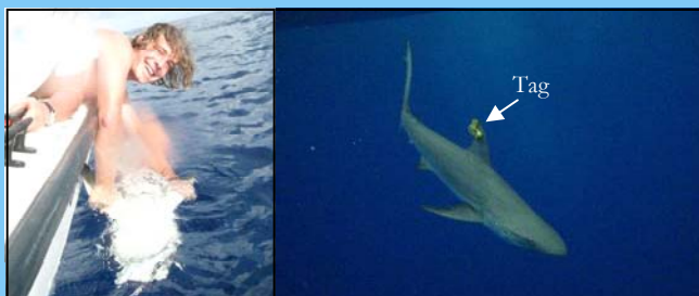
Left: Ollie Dubock holding a reef shark in tonic immobility ("hypnotised" on its back). Right: Releasing the tagged shark.

Sharks are tagged, measured and DNA sampled.